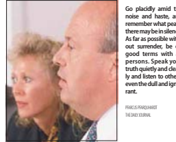
Go placidly amid the noise and haste, and remember what peace there may be in silence. As far as possible without surrender, be on good terms with all persons. Speak your truth quietly and clearly and listen to others, even the dull and ignorant.

Nurture strength of spirit to shield you in sudden misfortune. But do not distress yourself with imaginings. Many fears are born of fatigue and loneliness. Beyond a wholesome discipline, be gentle with yourself.