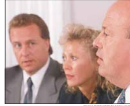
Go placidly amid the noise and haste, and remember what peace there may be in silence. As far as possible without surrender, be on good terms with all persons. Speak your truth quietly and clearly and listen to others, even the dull and ignorant.

With all its sham, drudgery and broken dreams, it is still a beautiful world. Be cheerful. Strive therefore to be happy.